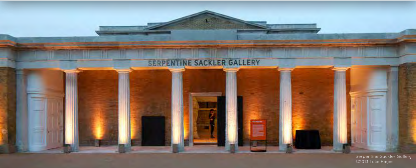
Serpentine Sackler Gallery

The next task was to select appropriate speaker locations in order to provide seamless, high quality audio in the gallery spaces. Working closely with the architects, the applications team at Amina calculated that eleven speakers in total would be required to cover the gallery space. Positioned in-ceiling the spacing between speakers is a large 5m – a benefit of their ultra-wide dispersion. Conventional, and typically more directional, speakers would need a closer spacing and therefore a higher quantity which increases installation, cabling and amplification costs.