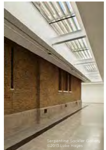
Serpentine Sackler Gallery

Amina Technologies Ltd: Cirrus House, Glebe Road Huntingdon Cambridgeshire England PE29 7DL