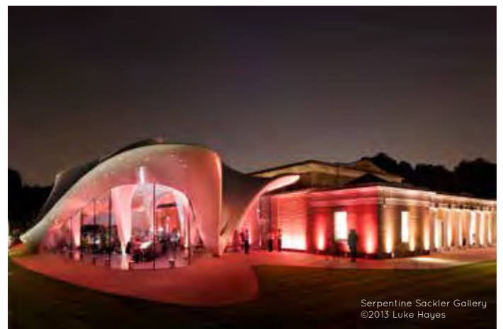
Serpentine Sackler Gallery

Highly intelligible sound extends to every corner of the Gallery space. Music reproduction is smooth and full of detail, as Amina's unique vibrational panel technology works in harmony with the interior acoustics. Together with an expertly setup audio system, Amina has provided the Serpentine Sackler Gallery with the perfect loudspeaker solution, combining the ultimate in visual discretion with seamless, high clarity audio coverage.