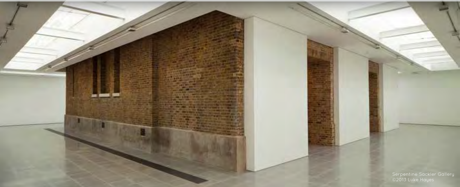
Serpentine Sackler Gallery