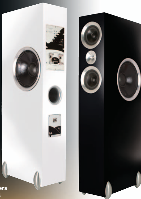
Speakers ACT A4

Piano white 0000000000 Piano black 0000000000